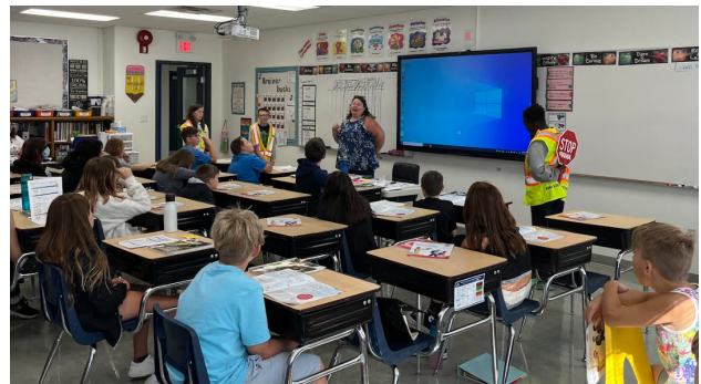
Quality Teaching and Learning