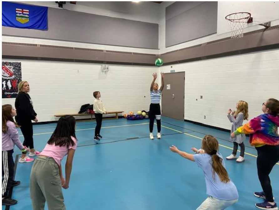
College Program Ever Active Schools