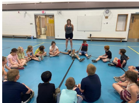
Faith and Wellness Day - May 2023