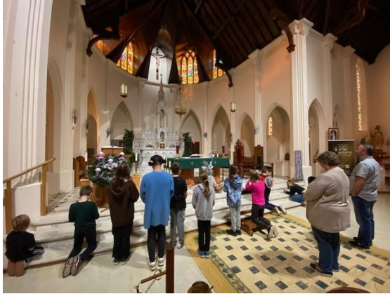
Grade Five Retreat - Prayer