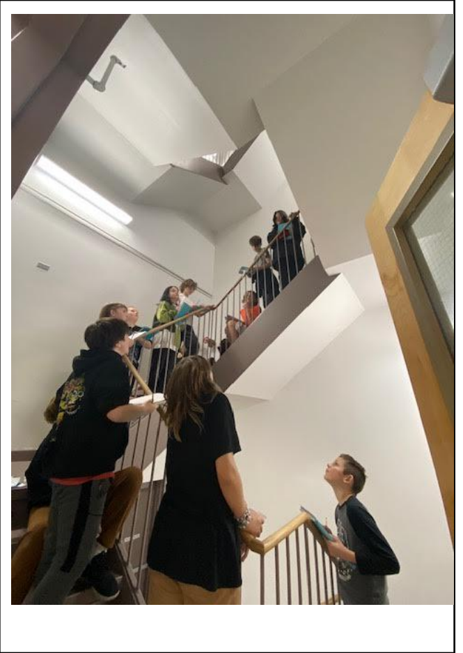
Grade Six Science - Flight