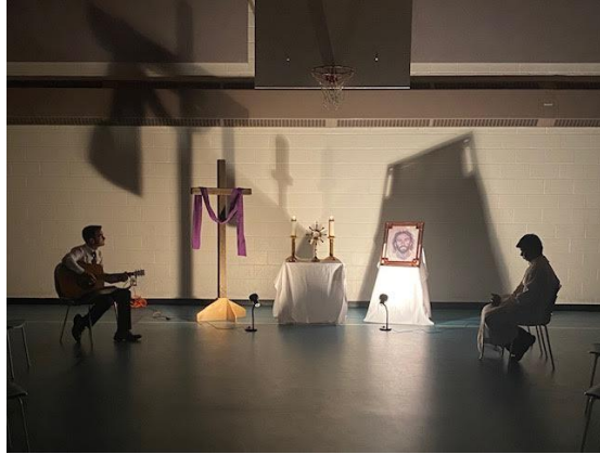
Adoration of the Blessed Sacrament - Lent