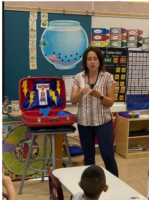
Grade One Math Lesson