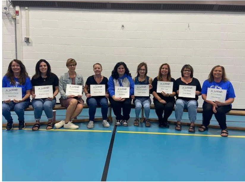
Our Tremendous Learning Assistants