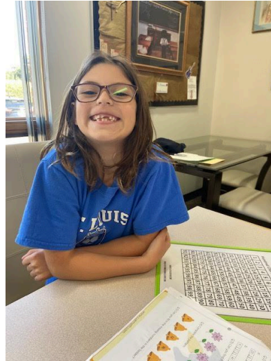
One to one Math Assistance