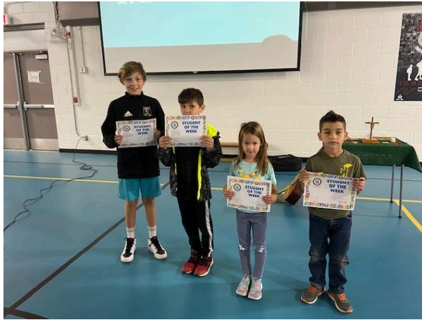
Student of the Week Presentations

exciting. New parents to our school are joining our School Council which is very active for a smaller school. Parents continue to support school functions such as dances, book fair, bingo, games and movie nights. At home initiatives such as home reading programs, online math and phonics programs for parental assistance have also been incorporated. Parents feel welcomed and supported at St. Louis!