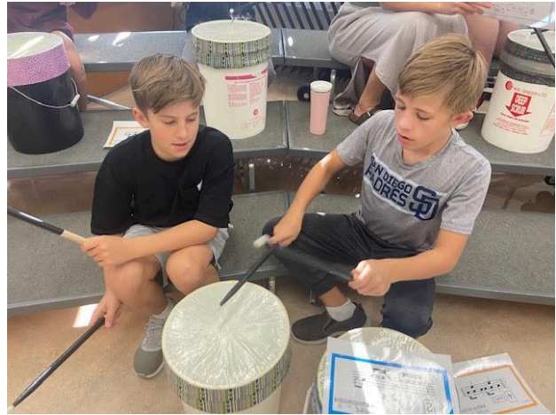
Drumming in Music Class