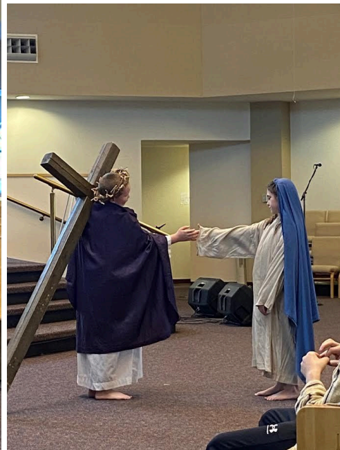
Stations of the Cross Performed at Holy Family Parish - Lent