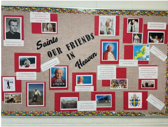
Saint of the Month Bulletin Board