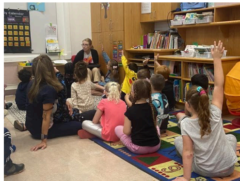
Social Studies in Grade 1-2