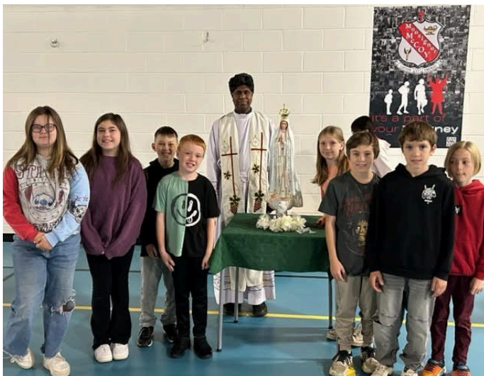
Consecration to Mary - Oct.