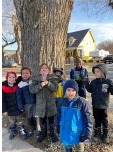
Early Learning Program Students on a Community Walk