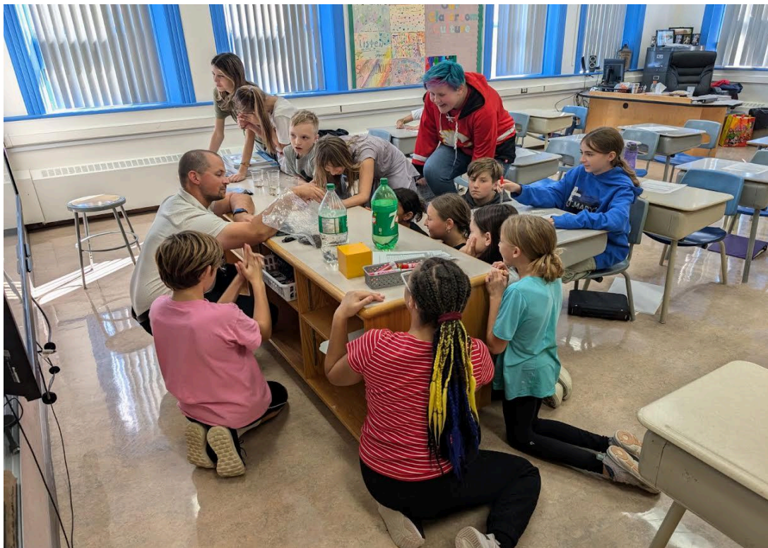
Science in Grade 5-6