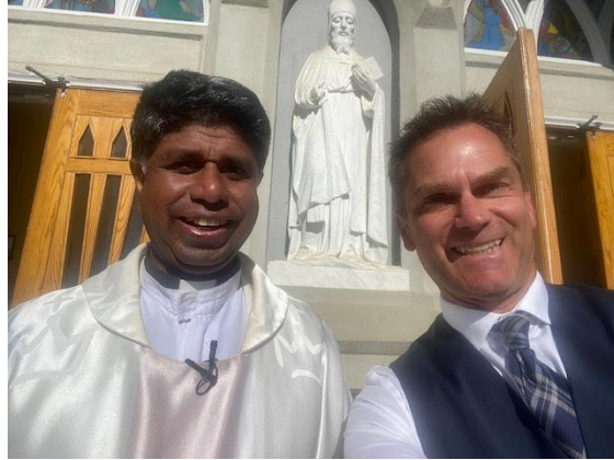
Year Opening Mass